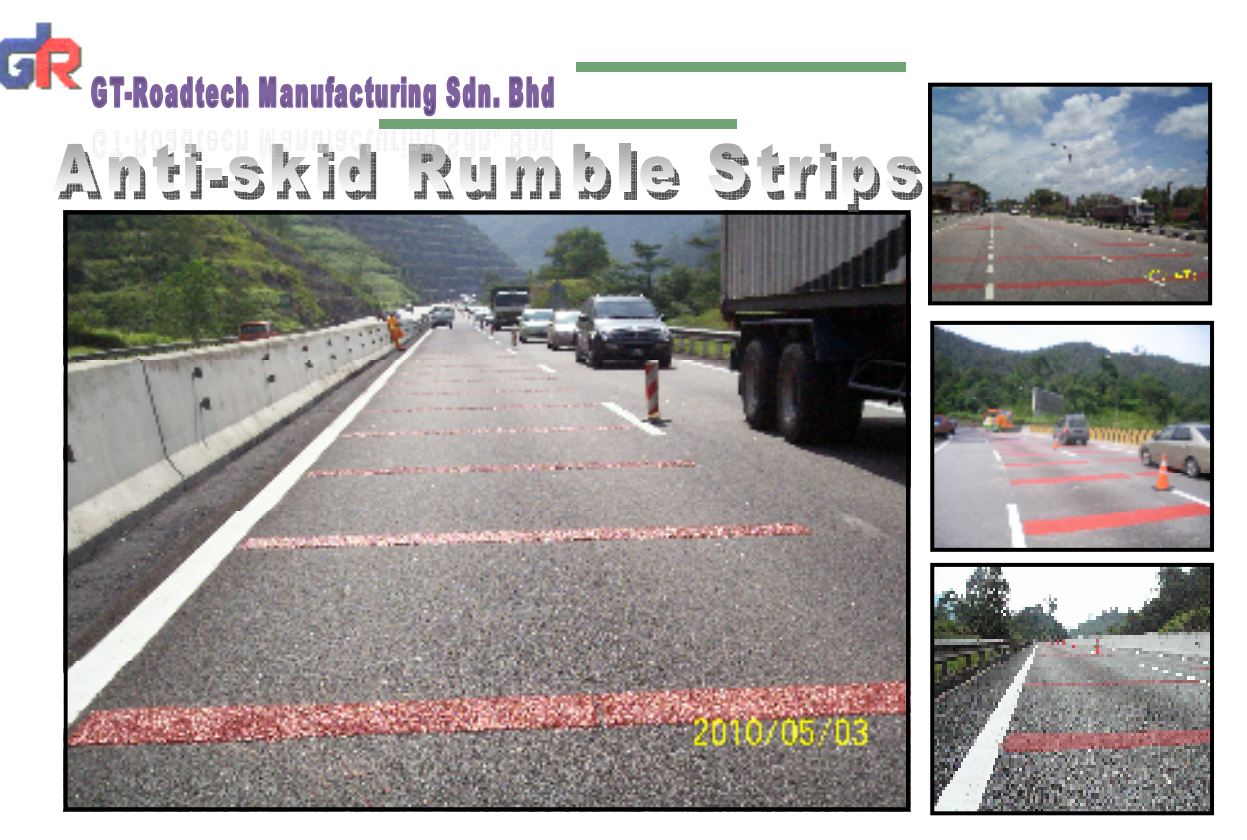
GT-Roadtech's Anti-skid Rumble Strips are based on Degaroute © highly durable MMA resins. The rumble strip system incorporates: